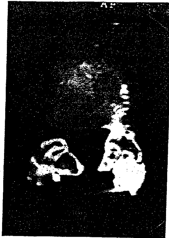
FIGURE 4B. Fusion of the articular graft: Confirmation by CT-scan.