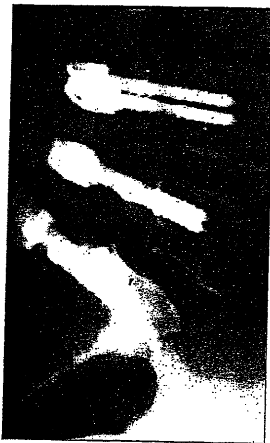
FIGURE 3. Pseudarthrosis: Breakage of the rod at 4 1/2 months in a case of spondylolisthesis.