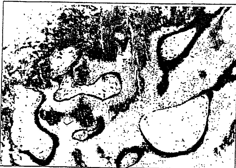
FIGURE 2. Biopsy of the bony callus defect.

There were no local complications and no inflammatory or infectious effects in this series. Except for the 2 patients who died of extra-surgical causes, there were no general complications.