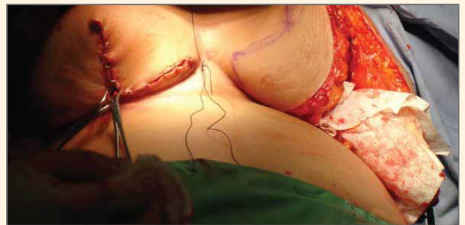
Wound on breast 1 is closed at 60 min, incision created on breast 2 and GuardaCare®XR Surgical placed.