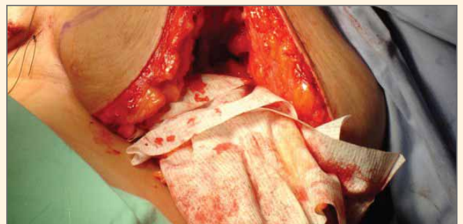
GuardaCare®XR Surgical maintaining hemostasis.