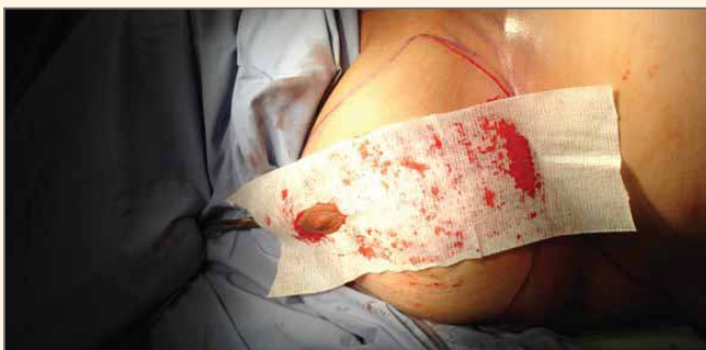
Wound site at 2 minutes.