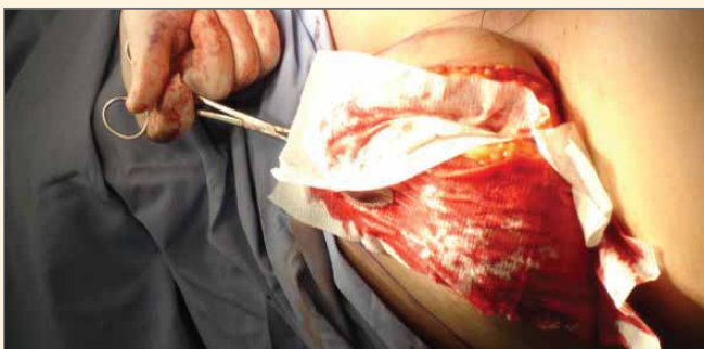
Wound site at 15 minutes, additional incision created in breast 1 and GuardaCare®XR dressing placed.