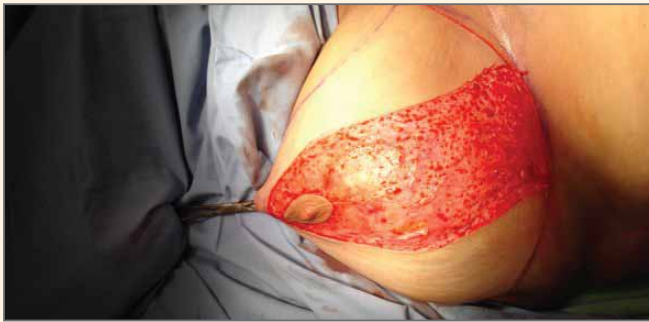
Breast 1 tissue and wound surface at start of procedure.

GuardaCare®XR Surgical is intended for use as a hemostatic dressing for temporary control of severely bleeding wounds such as surgical wounds and traumatic injuries.