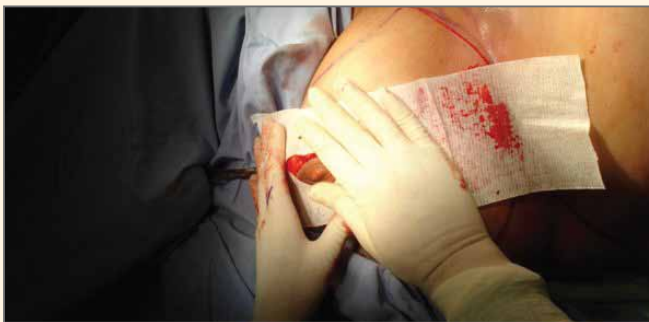
GuardaCare®XR Surgical dressing applied with pressure.